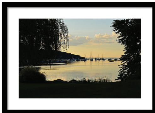
Scenic Images by Tim Votapka In the Gallery March 1 - 30