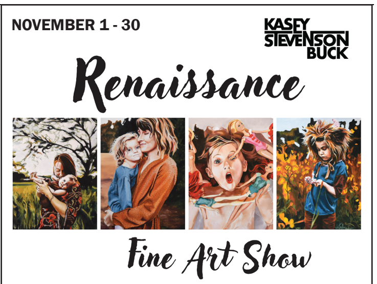
OPENING RECEPTION Thursday, November 2, 7:00 - 8:30 PM

The Library will be closed on Saturday, November 11 for Veterans Day. The Library will be open on Wednesday, November 22, from 10:00 AM - 5:00 PM and closed on Thursday, November 23 for Thanksgiving