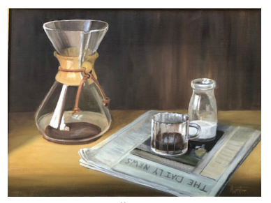
M. Ellen Winter

Friday, September 29, 10:00 AM to 4:00 PM